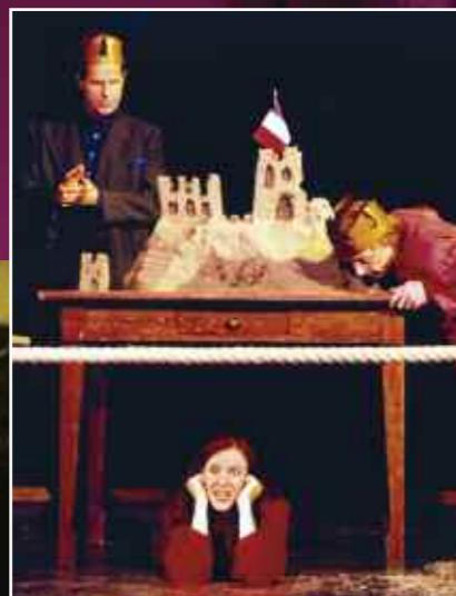
Theater Gruene Sosse: Henry V

Theatrau a chanolfannau celfyddydau sydd cyfranogi: