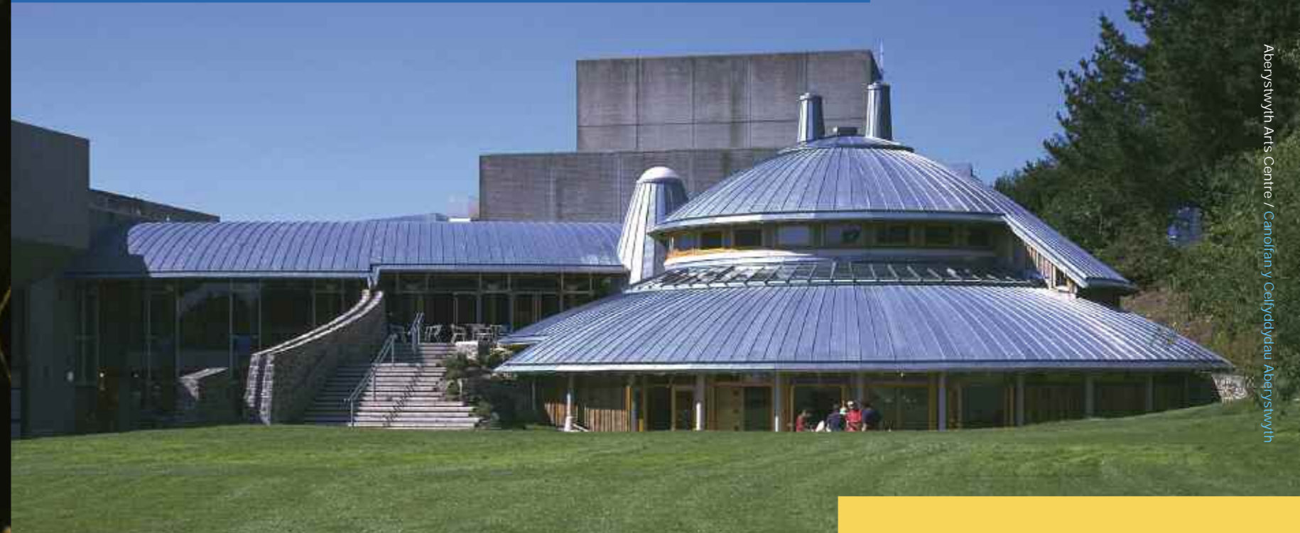
Aberystwyth Arts Centre / Canolfan y Celfyddydau Aberystwyth