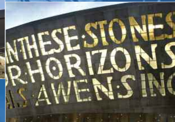
Wales Millennium Centre / Canolfan Mileniwm Cymru