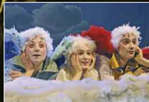
Théâtre Maât: The Angel's Leap