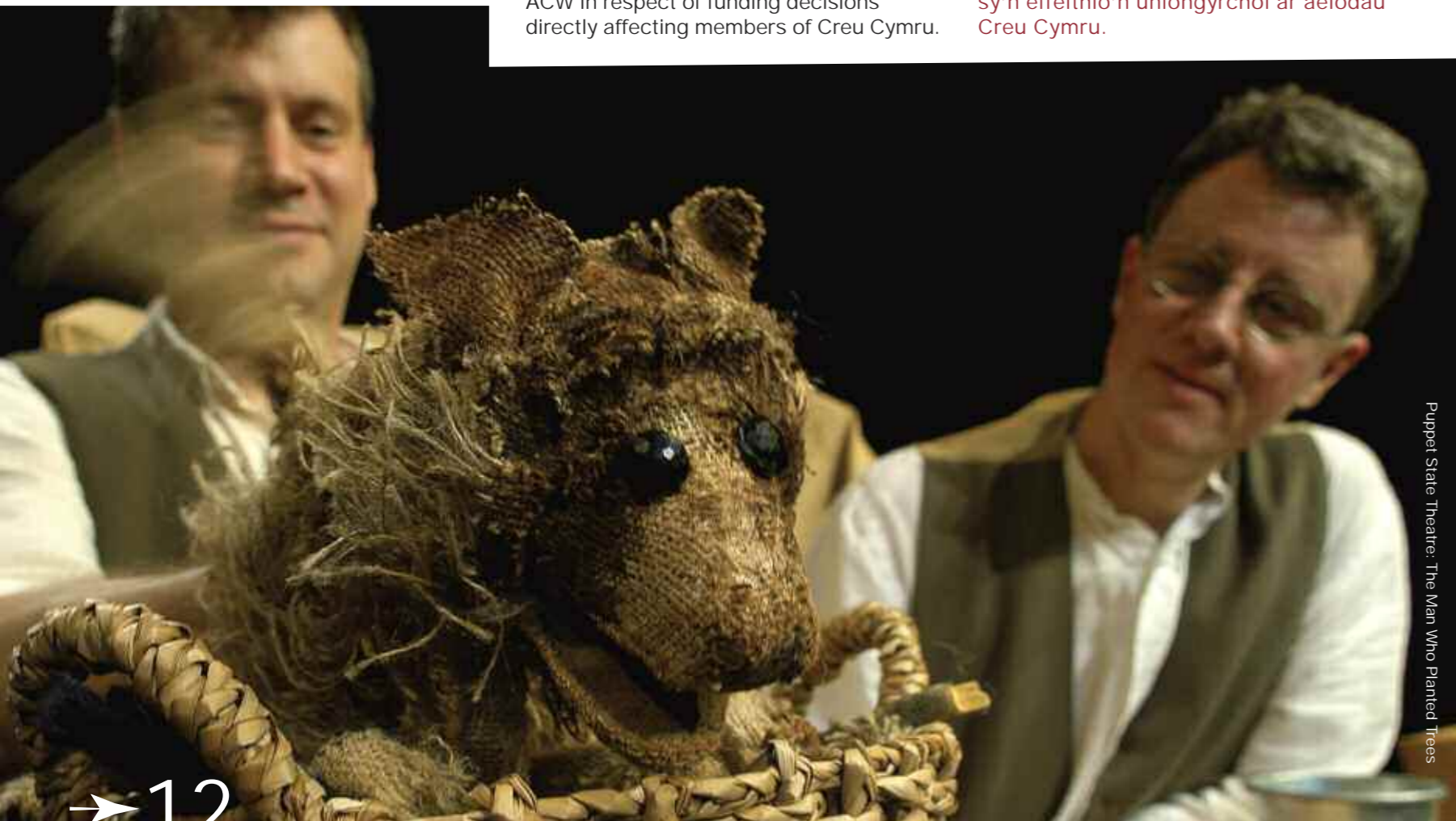
Puppet State Theatre: The Man Who Planted Trees

Gwanwyn 2008: gwnaethpwyd sylwadau i CCC ynglyn â phenderfyniadau ariannu sy'n effeithio'n uniongyrchol ar aelodau Creu Cymru.