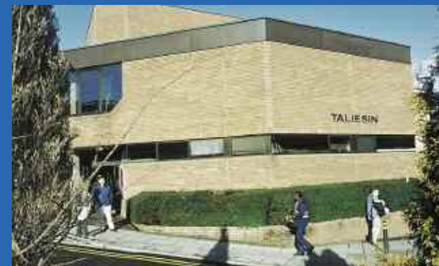
Taliesin Arts Centre / Canolfan y Celfyddydau Taliesin