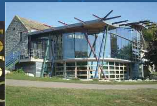
St Donats Arts Centre / Canolfan y Celfyddydau Sain Durlwyd