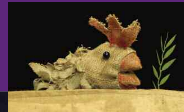
Puppet State Theatre: The Man Who Planted Trees

The acclaimed virtuoso of the mbira, a sacred instrument central to Zimbabwean Shona culture, Stella Chiweshe will tour together with her band in October 2008 to 8 members in Wales. This tour is part of Creu Cymru's International Routes programme and is supported by a grant from the Arts Council of Wales.