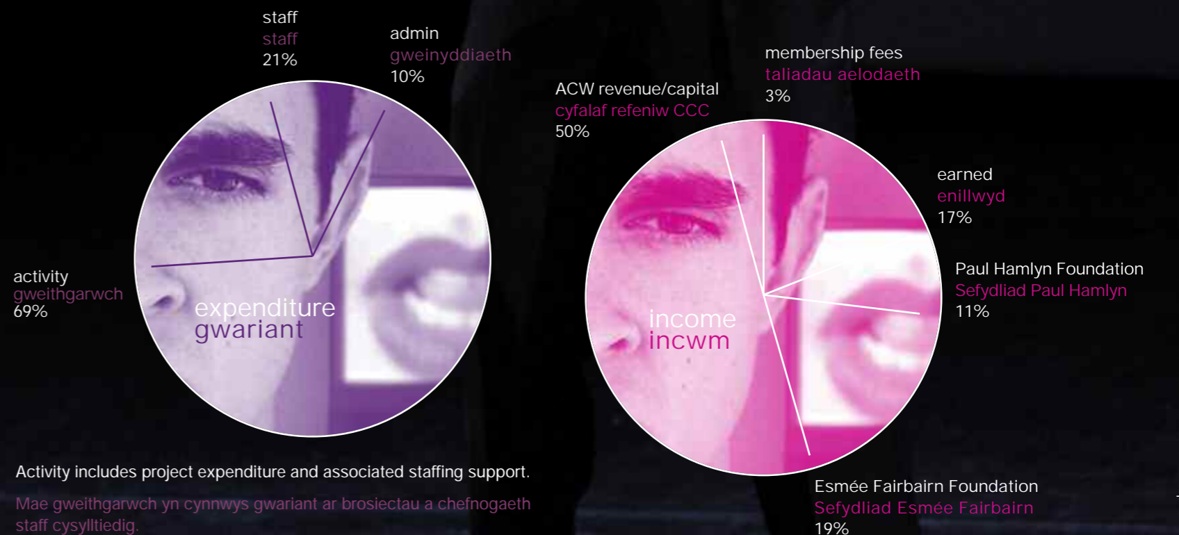
South Hill Park Arts Centre: Macbeth - Kit Bill Shakespeare

Grant prosiect CCC o £4,500 ar gyfer ymchwil aelodau