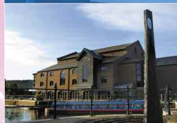
Theatr Brycheiniog / Theatr Brycheiniog