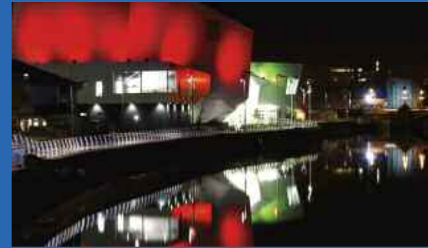
The Riverfront / Glan-yr-afon